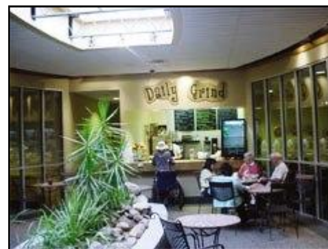
Newest location in the Sycamore Medical Center on US 20 between Elkhart and Mishawaka

base, outstanding customer service and great employees". Currently, the Daily Grind employs 20 to 24 people (eight of which are full time). As they continue to grow, Tanya is expecting that number to increase.