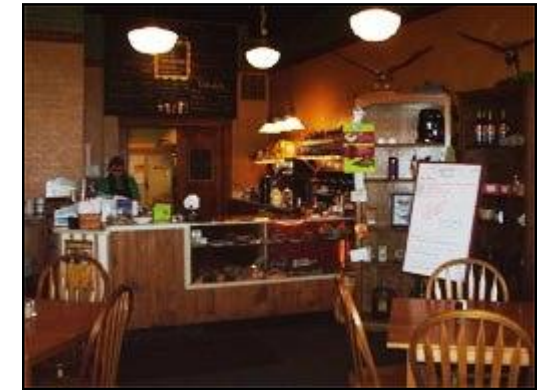
Downtown Elkhart Location in the Historic Green Block building near the River Walk

The Lexington Business Centre is many things to many people. For some, it is a place to call home as they start a new business and for others, it’s a stepping stone as they expand. For one of the newest tenants, The Daily Grind, the latter is the situation. As the Daily Grind continues to grow, they discovered the need to move their office out of their coffeehouse in the Green Block building on East Lexington in Elkhart. According to owner Tanya Bleiler, the LBC is a “perfect fit” for their needs. They now have nice office space where they can meet with vendors and suppliers.