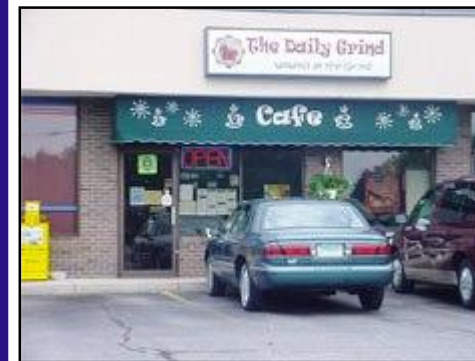
The Daily Grind Concord Location - Off the campus of Concord High School

The Daily Grind serves specialty coffee drinks, lattes, cappuccinos, and fresh fruit smoothies. In addition, they serve breakfast and lunch offering fresh, healthy foods.